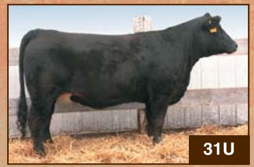
RDDS Future Prototype 13M x Brooks Above Par Al'd to Hooks Shear Force