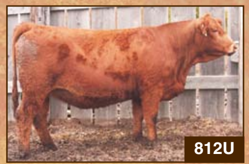
BF Snake Eyes x BodyBuilder Al'd to Winchester