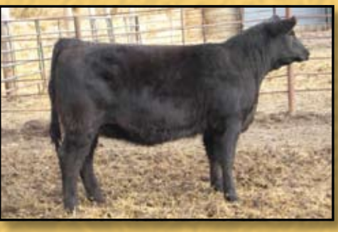
4E U402 Bush's Domain 503 x Ellingson Black Perfector BD: 3/8/09 BW: 81 lbs. Fancy SimAngus Open Heifer!

4E Simmentals Shane & Jennifer Erickson Plaza, ND 701-497-3558 701-898-1216 cell