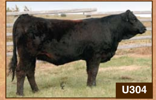
TNT Black Dynamite x KS Kayla Al'd to In Dew Time