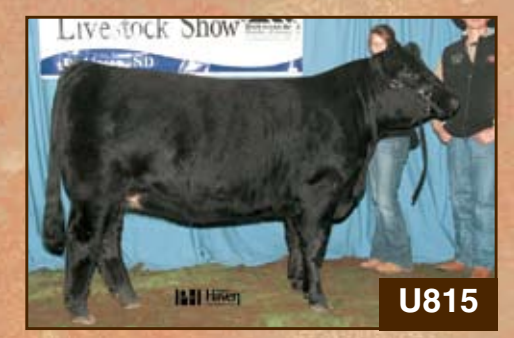
Dream On x Preferred Beef Al'd to 4E Pendelton U22