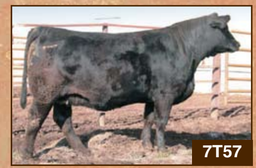
BDV Solution 603S x BDV TNT Black Hustle 41K Al'd to Stetson