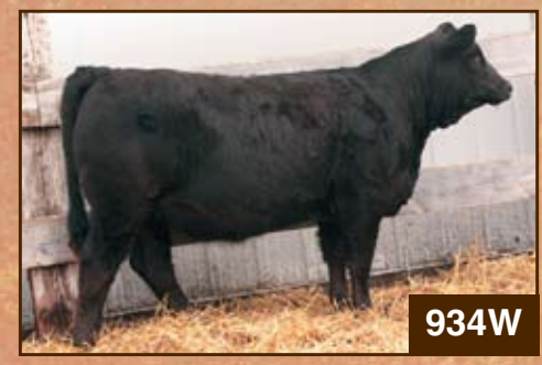
Sired by GW Lucky Man Open Purebred