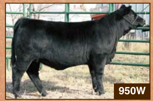
TC Broadside 781 x KS WCS Figure This M11 Open SimAngus

View the catalog online at: www.northdakotasimmental.com