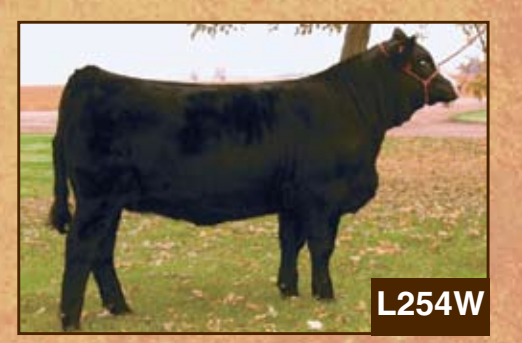
Sired by TNT Top Gun Open Purebred